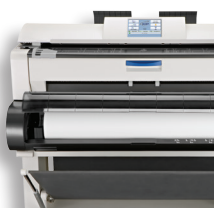
Front System Access

The compact design of the KIP 700m provides front access to the touchscreen, auto roll paper loading, system operation & copy/print delivery.